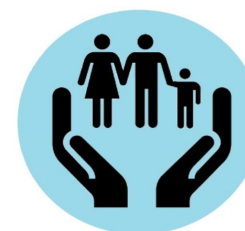
Involvement in Child Welfare System