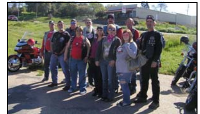
Mother Lode and the Woodland Feather River BACA (Bikers Against Child Abuse) teams.

Feedback from the participants was that “they had a blast,” and the board of supervisors have already said to sign them up again for next year!