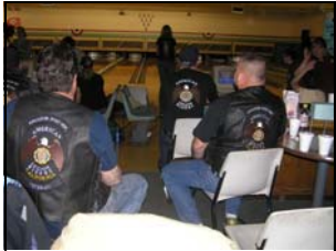
American Legion Ambulance Riders