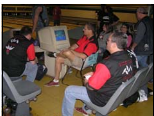
Team Golden State Cellular

Our generous bowlers also contributed 58 pounds of groceries to the Interfaith Food Bank!